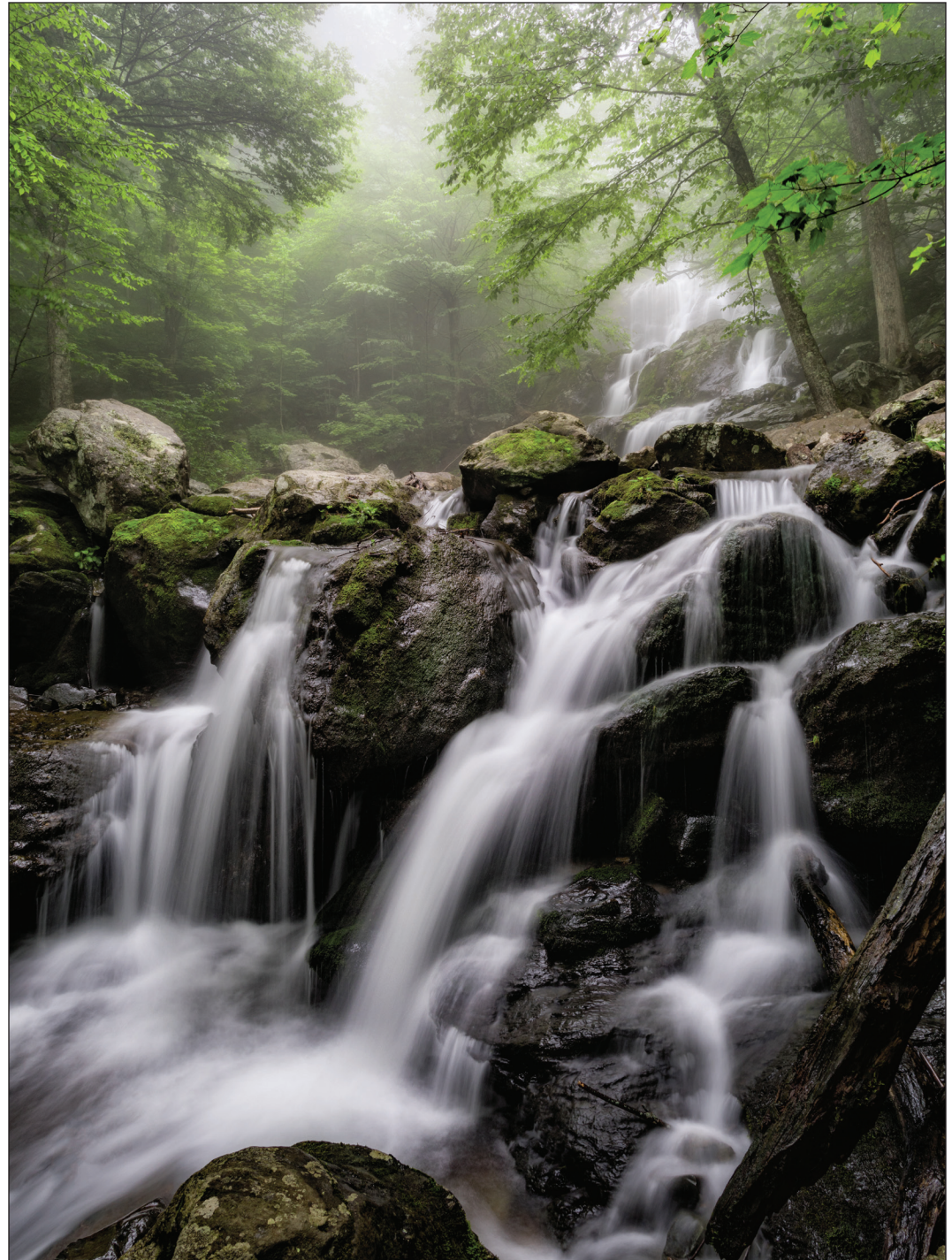
Photo Credit: Dark Hollow Falls by C. Renee Martin of Fredericksburg | Courtesy of Scenic Virginia