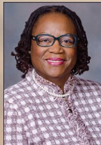
Sen. Mamie Locke