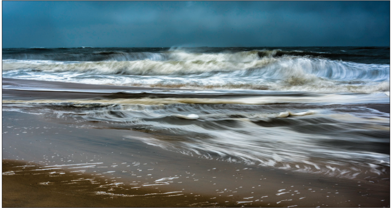
Photo Credit: Hurricane Jose Offshore at Chincoteague by Anne Bell Scott of Charlottesville | Courtesy of Scenic Virginia

The legislation gets us to the 100 percent clean energy benchmark by requiring utility investments in energy efficiency programs first, instead of expensive infrastructure; aggressive benchmarks for utility deployed wind and solar