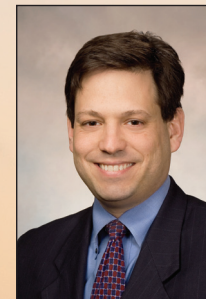
Sen. Scott Surovell