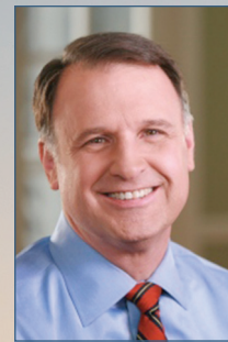
Sen. Creigh Deeds