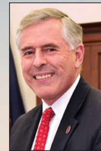
Sen. John Edwards