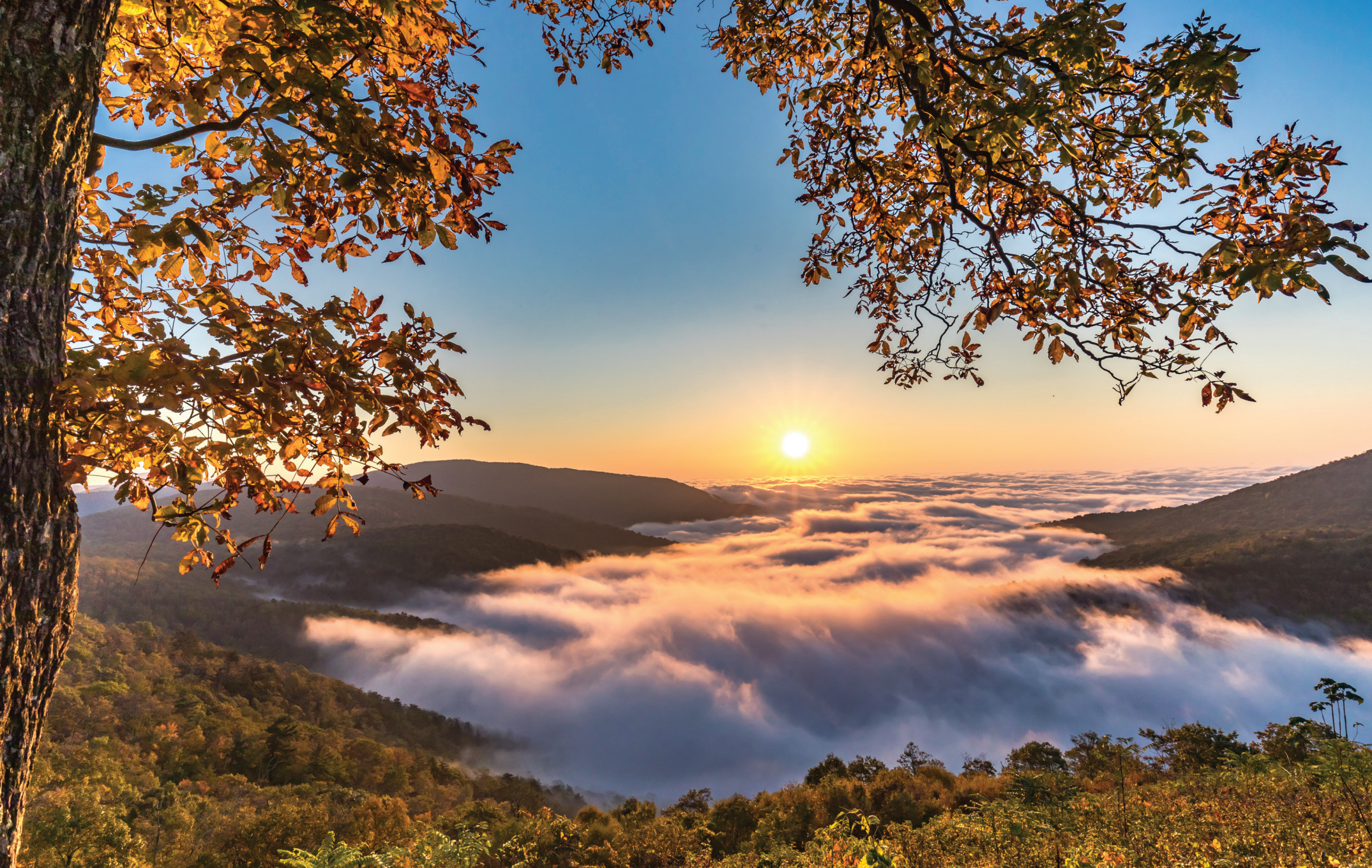
Sunrise over Fog in the Shenandoah

The Virginia League of Conservation Voters is the political voice of conservation in the Commonwealth. We work tirelessly to protect all of Virginia's treasured natural resources – clean air and water, thriving communities and rural landscapes, productive farms and forests, historic battlefields and Main Streets, and ample public lands and open spaces.