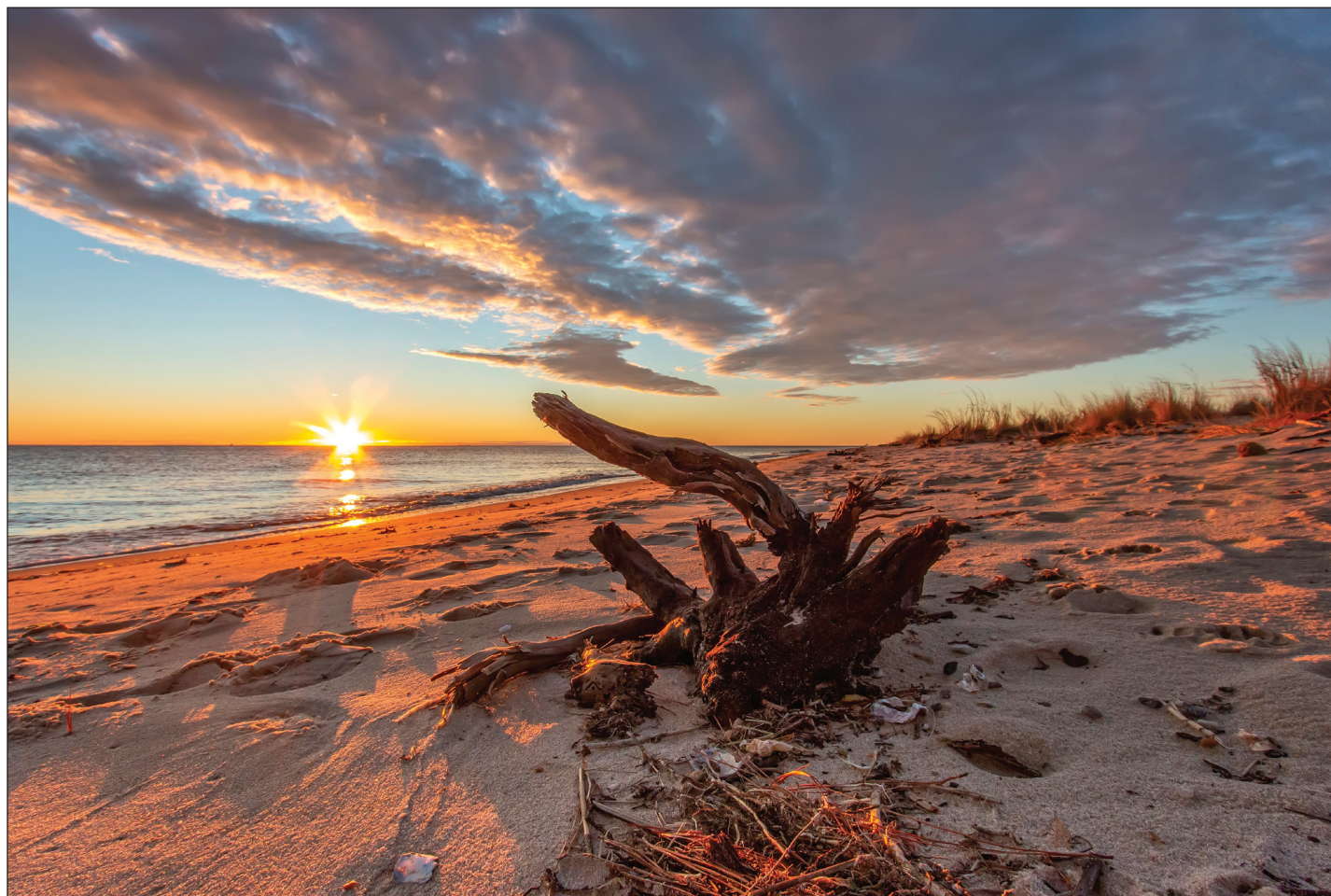
Photo Credit: Sunrise at Bethel Beach by Barbara Houston of Quinton | Courtesy of Scenic Virginia