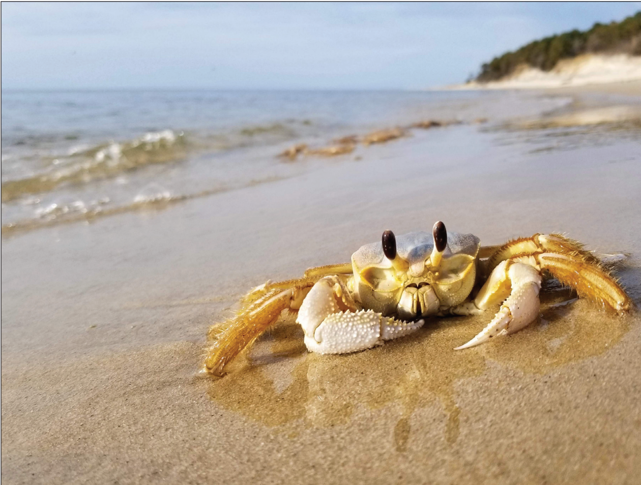
Photo Credit: Such a Fine Fellow by Kevin Divins of Henrico | Courtesy of Scenic Virginia

within 24 hours of the spill. DEQ was then only required to notify the public via a local newspaper if they determined the discharge could be detrimental to use of state waters. Beyond that, there was no time period within which spill information must be made public.