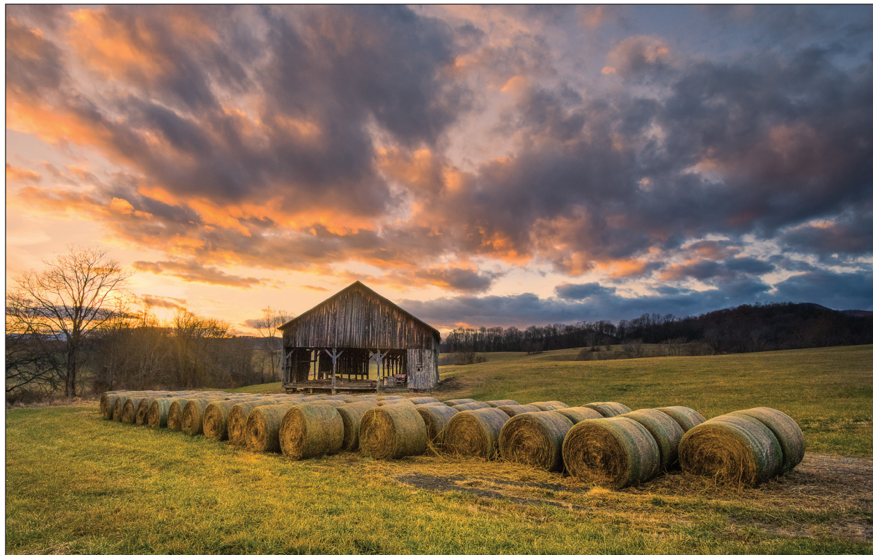
Photo Credit: Old Barn Sunset by Robert Golub of Culpeper | Courtesy of Scenic Virginia

This legislation removes barriers to solar renewable energy and amends the Commonwealth Energy Policy to support distributed solar generation. These changes to the Commonwealth Energy Policy hope to promote solar energy by encouraging private sector investment in distributed renewable energy, supporting distributed renewable energy projects to increase security and reliability, and supporting landowners' right to generate their own renewable energy. The included reforms give local governments more opportunities to install solar on government property and help residents and businesses invest in solar. This can create savings for taxpayers, decrease the need for fossil fuels, help meet local sustainability goals, ensure access to solar by low-income apartment tenants, and support local jobs and economic development.