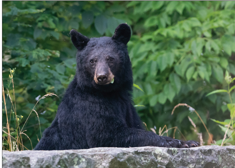
Watchful Mother Bear

The legislation passed 55-42 in the House of Delegates and 23-17 in the Senate.