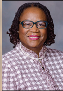
Sen. Mamie Locke