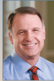
Sen. Creigh Deeds