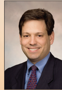
Sen. Scott Surovell