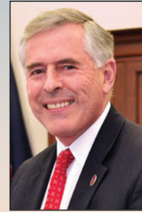
Sen. John Edwards