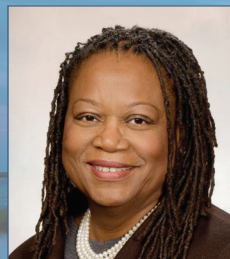
Sen. Mamie Locke