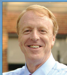
Sen. George Barker

* Delegate Ibraheem Samirah also earned a 100 percent score in 2019. Because he was sworn in during the last week of the General Assembly, this score only reflects two recorded votes from the reconvened, April session. He is therefore not listed as a Legislative Hero for 2019.