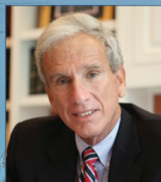
Sen. Dick Saslaw