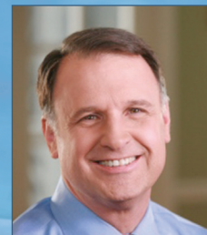
Sen. Creigh Deeds