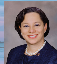
Sen. Jennifer McClellan