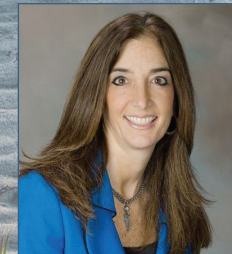
Del. Eileen Filler-Corn