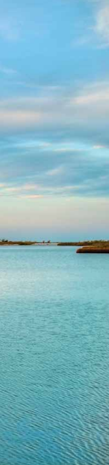
Bay/Foxwells by aura S. Dent of Callao | Courtesy of Scenic Virginia